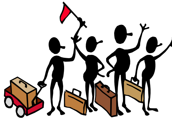
3. Public participation