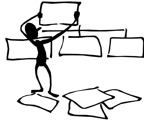
2. Process design